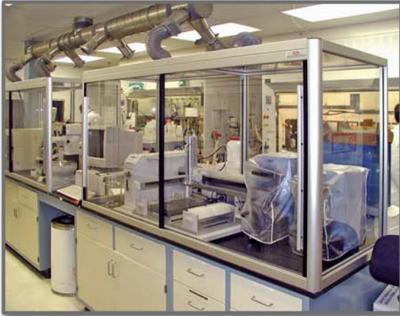
Choose from a wide range of door options.